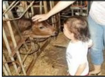
Pre School Visit a Dairy Farm Page 4

Shabbat: 9:30 am Minian followed by Kiddush