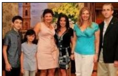
63rd Israeli Independence Day Page 5