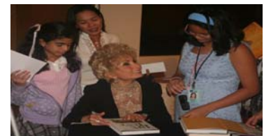
Rebbetzin signing her books