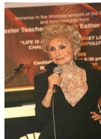
Rebbetzin Esther Jungreis