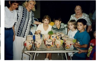
Pictures from yesteryears Tu B'Shevav planting a tree in front of the Synagogue and children making dolls that will grow hair

Tu B'Shevav, the 15 th day of the Jewish month of Shevat, is a holiday also known as the New Year for Trees. The occasion has long been a Jewish tradition to honor trees and appreciate the food, shade and shelter they provide.