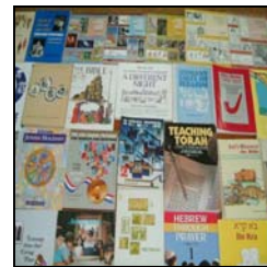
Some of the many titles