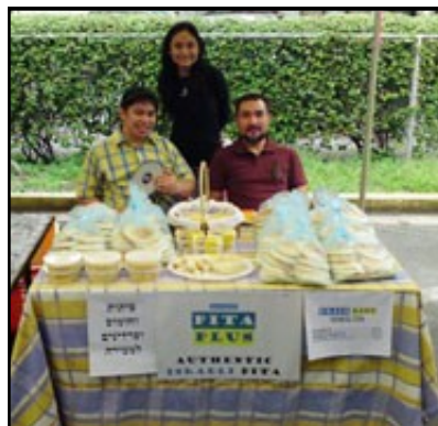
Monthly Bazaars at the American Women's Club and Legasi Village